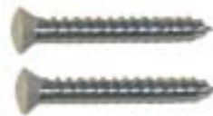
DRYWALL SCREW 1" - (2)